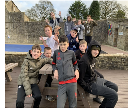
Visit to Bolton Abbey whilst on a Residential At Playaways— Amazing facilities all Enjoying Outside heated swimming pool too !