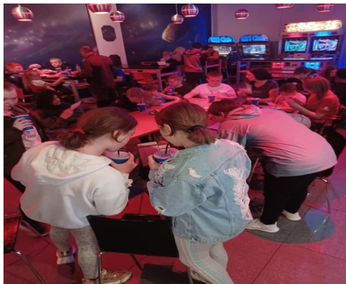
First Play February scheme after Lock down (Covid 19)