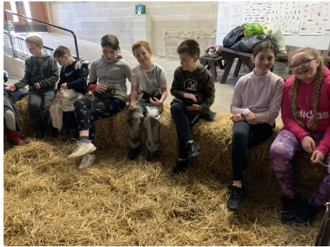
Holding the guinea pigs and pigs - learning how to care for them and what foods they eat too . November 2021