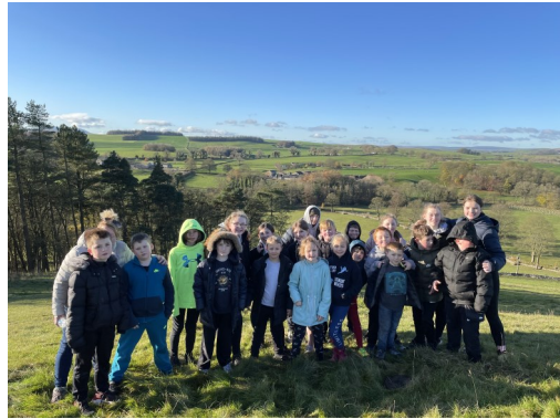
Reaching to the top What a view ! So worth it Adventuring the Yorkshire dales—Bolton Abbey And Malham