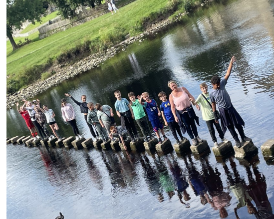
Bolton Abbey Team Effort crossing the stepping Stones —all experiencing the Yorkshire dales—